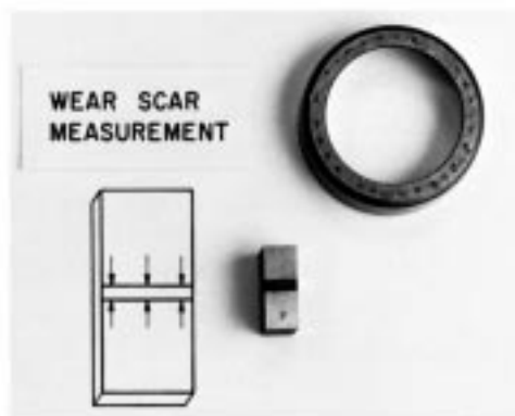
FIG. 3 Test Specimen Wear Scar Measurement

10.2 Calculate the coefficient of friction values from the friction force value as follows: