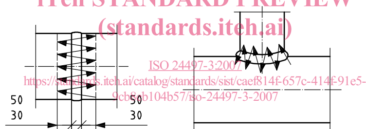
b) Moving the sensor perpendicular to the welded joint