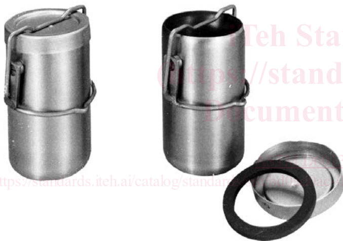
FIG. 2 Launder-Ometer Stainless Steel Specimen Containers

4.7 Soap Solution, 7 prepared by dissolving 5 g of standard neutral chip soap in 1 L of distilled water (see 7.3).