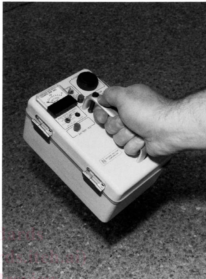
NOTE 1—Hand monitors are computer-based radiation detection systems that operate on battery power. The operator plays an important part in effective hand-held monitoring

4.2 This guide provides information on different types of monitors for searching pedestrians and vehicles. Each monitor has an inherent sensitivity at a particular nuisance alarm rate that must be low enough to maintain the monitor's credibility. Sensitivity and nuisance alarm rates are both governed by the alarm threshold so it is very important that corresponding values for both be known when measured, estimated, or specified values are discussed. Fitting SNM monitors into a