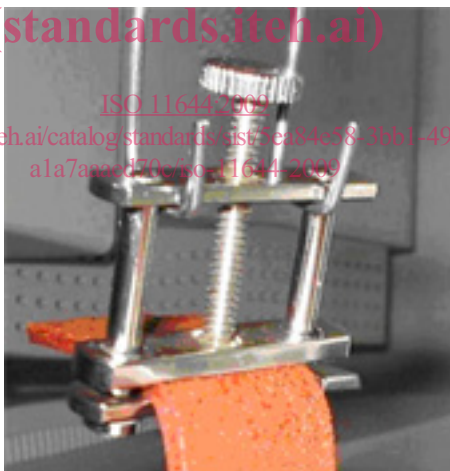
Figure 3 — Flat-jawed clamp

https://standards.itech.ai/catalog/standards/sist/7ea84e58-3bb1-4905-b856-a1a7aaed376e/iso-11644-2009