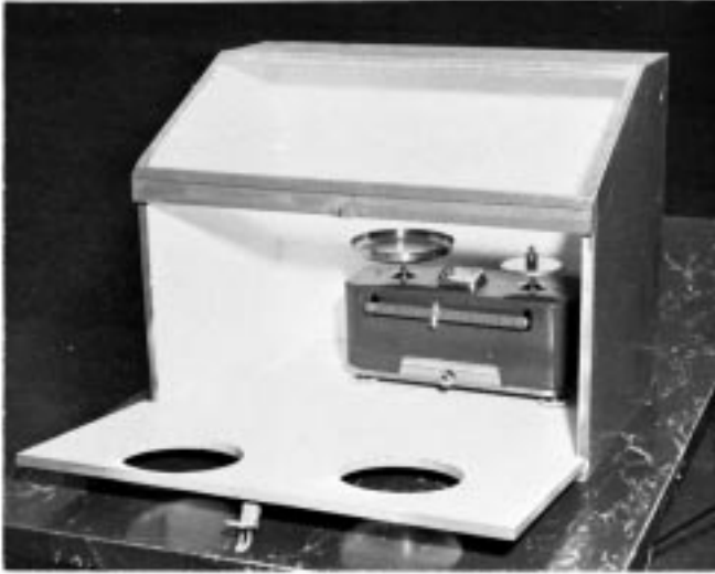
FIG. 1 Weighing Box and Balance

6.1.2 Create a loop with the duct tape with the adhesive side facing out. Place two loops of duct tape on one edge of each of the geotextile fabric pads.