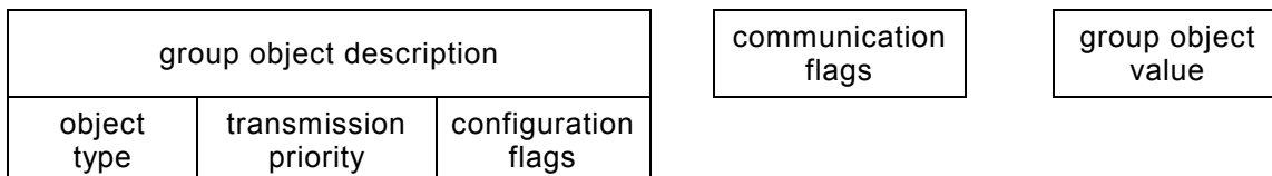
Figure 2 – Data structure of group objects