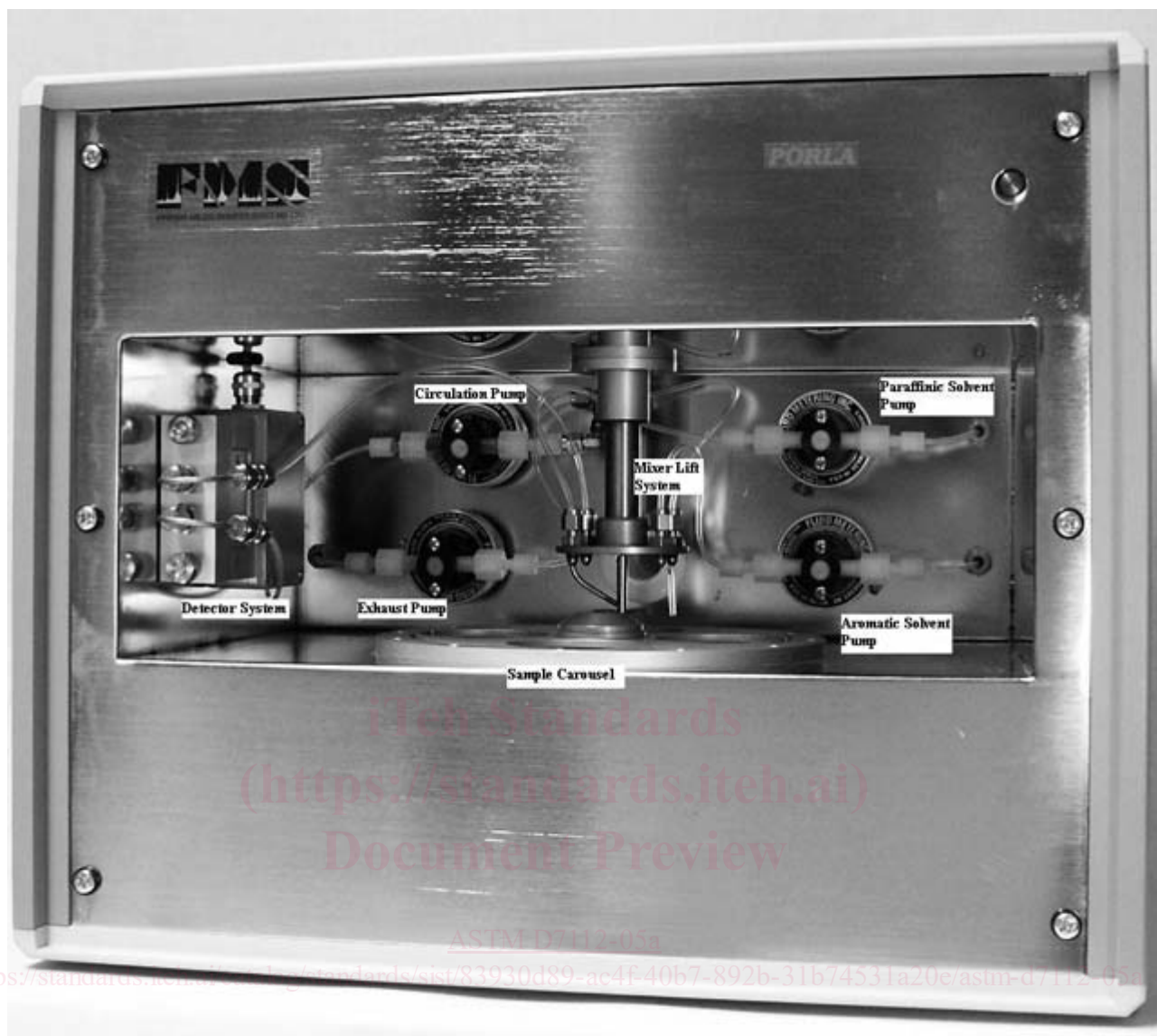
FIG. 1 PORLA Heavy and Crude Oil Stability and Compatibility Analyzer