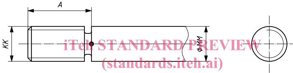
Figure 2 — Male thread without shoulder for hydraulic cylinder piston rods