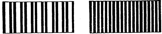
FIG. 4 Stroboscopic Lines Appearing as Multiples that May be Observed Before 200-r/min Reached