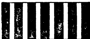
FIG. 3 Stroboscopic Lines Opening When Timer is Adjusted to Exactly 200 r/min

NOTE 4—Table 1 has been constructed so that it is not necessary to interpolate between loads to obtain the KU corresponding to the load to produce 100 revolutions in 30 s. The table provides KU values computed for a range of 27 to 33 s for 100 revolutions.