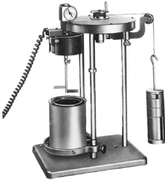
FIG. 1 Stormer Viscometer with Paddle-Type Rotor and Stroboscopic Timer

9.3 When the temperature of the specimen has reached equilibrium, stir it vigorously, being careful to avoid entrapping air, and place the container immediately on the platform of the viscometer so that the paddle-type rotor is immersed in the material to the mark on the shaft of the rotor.