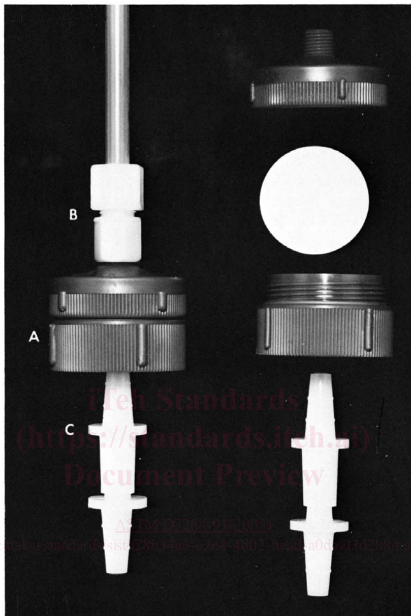
FIG. 2 Details of Attachment of the Filter Assembly and Limiting Orifice to a Bicarbonate-Coated Tube (7-mm Inside diameter). (A) Polypropylene Filter Holder, (B) Plastic Female Connector, (C) Limiting Orifice

7.3.2 The system shall be equipped so that pressure and temperature of the gas at the point of metering also are known for correcting sample volumes to standard conditions of 101.3 kPa [29.92 in. Hg] at 25°C [77°F].