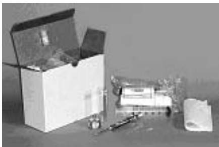
FIG. 3 Six Pack and Test Items

6.3.5 Pipet, (G) with Plastic Tip (F) —An automatic hand pipet with a disposable plastic tip. A pipet is supplied with each Micro-Separator.