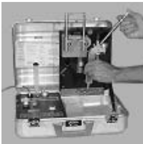
FIG. 4 Water Addition