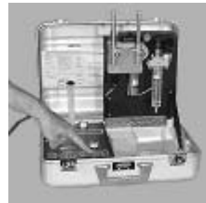
FIG. 5 Emulsification

syringe and place (see Note 4 ) the syringe barrel on the emulsifier mount (turn to lock in place). Visually inspect that the syringe barrel is properly aligned concentrically with the mixer shaft and is not touching the propeller. Select Test Mode A by pressing A pushbutton.