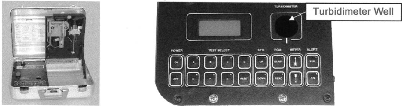
FIG. 1 Micro-Separometer Mark V Deluxe and Associated Control Panel