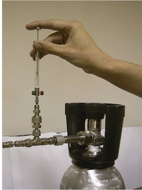
Figure H.1 — Example of liquid introduction via a syringe

When using this method, it is important to eliminate the loss of component in the syringe and especially in the needle. It is therefore recommended to replace the needle after filling and before weighing. Especially with very volatile components, the remaining liquid droplets may vaporize during weighing.