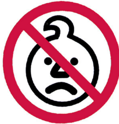
Figure 5 — “Keep Away From Children” symbol