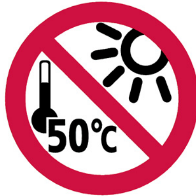
Figure 7 — “Never expose to heat above 50 °C or to prolonged sunlight” symbol