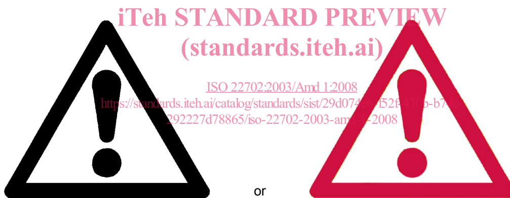
Figure 4 — “Warning” symbol