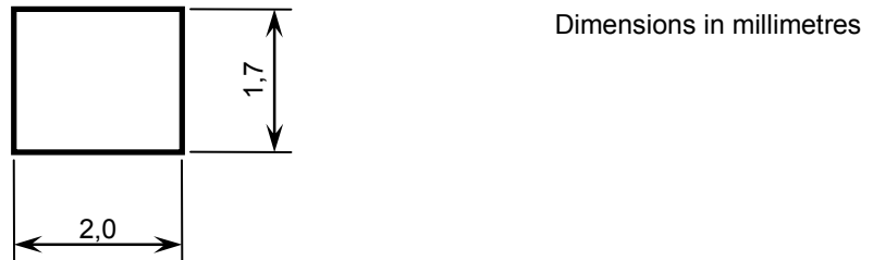
Figure 1 — Minimum dimensions of the contacts

This part of ISO/IEC 7816 does not define the maximum dimensions or shape of the contacts except for the requirement that each contact shall be electrically isolated from the other contacts.