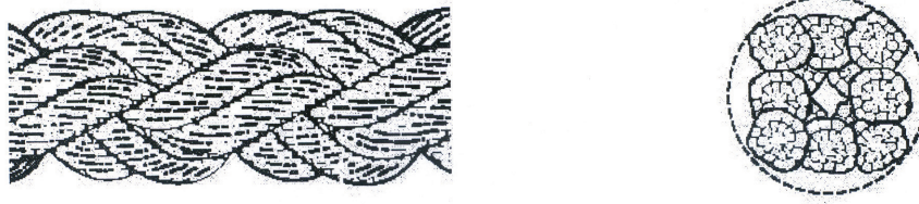
Figure 2 — Shape of an 8-strand braided rope (type L)