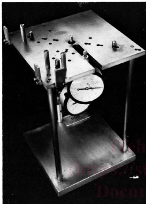
FIG. 1 Apparatus for Square Tile, Set Up for Measurement of 4 1/4- by 4 1/4-in. (108- by 108-mm) Tile

the edge or diagonal being tested. It is realized that the percentage values based on the overall edge length, or on the overall diagonal length of a tile will be slightly lower than those based on the distance between reference points. However, the ratio of the overall lengths to the distance between reference points will be practically constant for any particular size of tile and, therefore, the percentage values will be comparable and equally indicative of warpage.