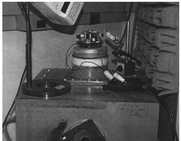
FIG. 1 Motor Mounted to Plenum Chamber

7.1.1 The motor/fan system inlet shall be centered with respect to the outlet opening of the plenum chamber.