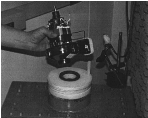
FIG. 2 Example of Standoff Pipe

8.3 While operating the vacuum cleaner motor/fan system per 8.2, insert orifice plates sequentially into the orifice plate holder of the plenum chamber starting with the largest size