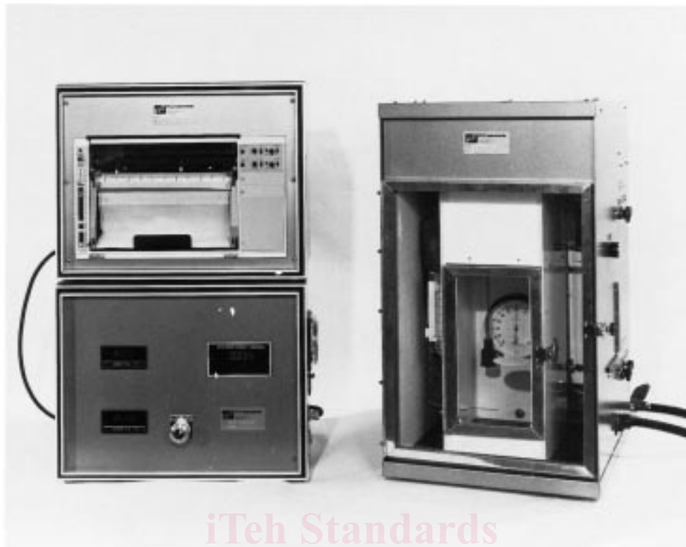
FIG. 3 Automatic Thin-Film Evaporometer

13.2 Close the evaporometer and cabinet doors and equilibrate both chambers as in 6.2.