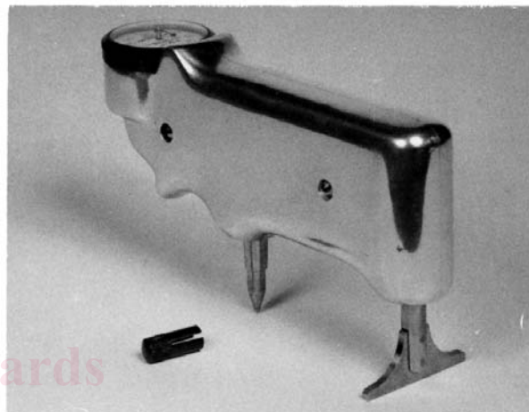
FIG. 1 Barcol Impressor, Model 934-1