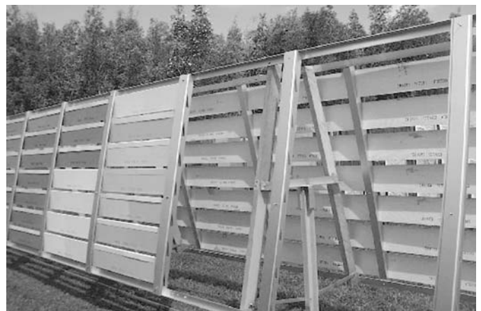
FIG. 1 Typical Exposure Rack

7.4 For exposures of paints on test fixtures described in 6.2 and Fig. 1, a test panel should be a 914-mm (36-in.) length of 152-mm (6-in.) siding substrate unless otherwise agreed upon.