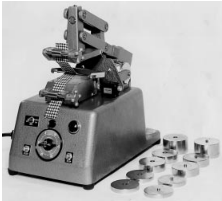
FIG. 2 Commercial Flexing and Abrasion Tester

thoroughly with water and consult physician; perform operations under a fume hood with the exhaust on; store in an approved, labeled safety can; and dispose of used Stoddard solvent as directed by city, state, or federal ordinances, as required. Refer to the manufacturer's Material Safety Data Sheets (MSDS) for information on handling, use, storage, and disposal of material and reagents used with this test method.