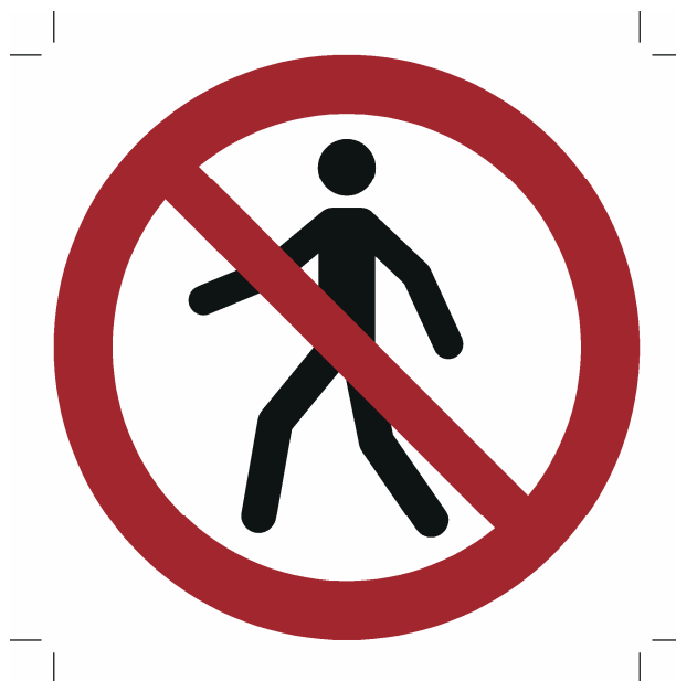
Figure 2 — No thoroughfare (ISO 7010, P004)

iTeh STANDARD PREVIEW (standards.iteh.ai)