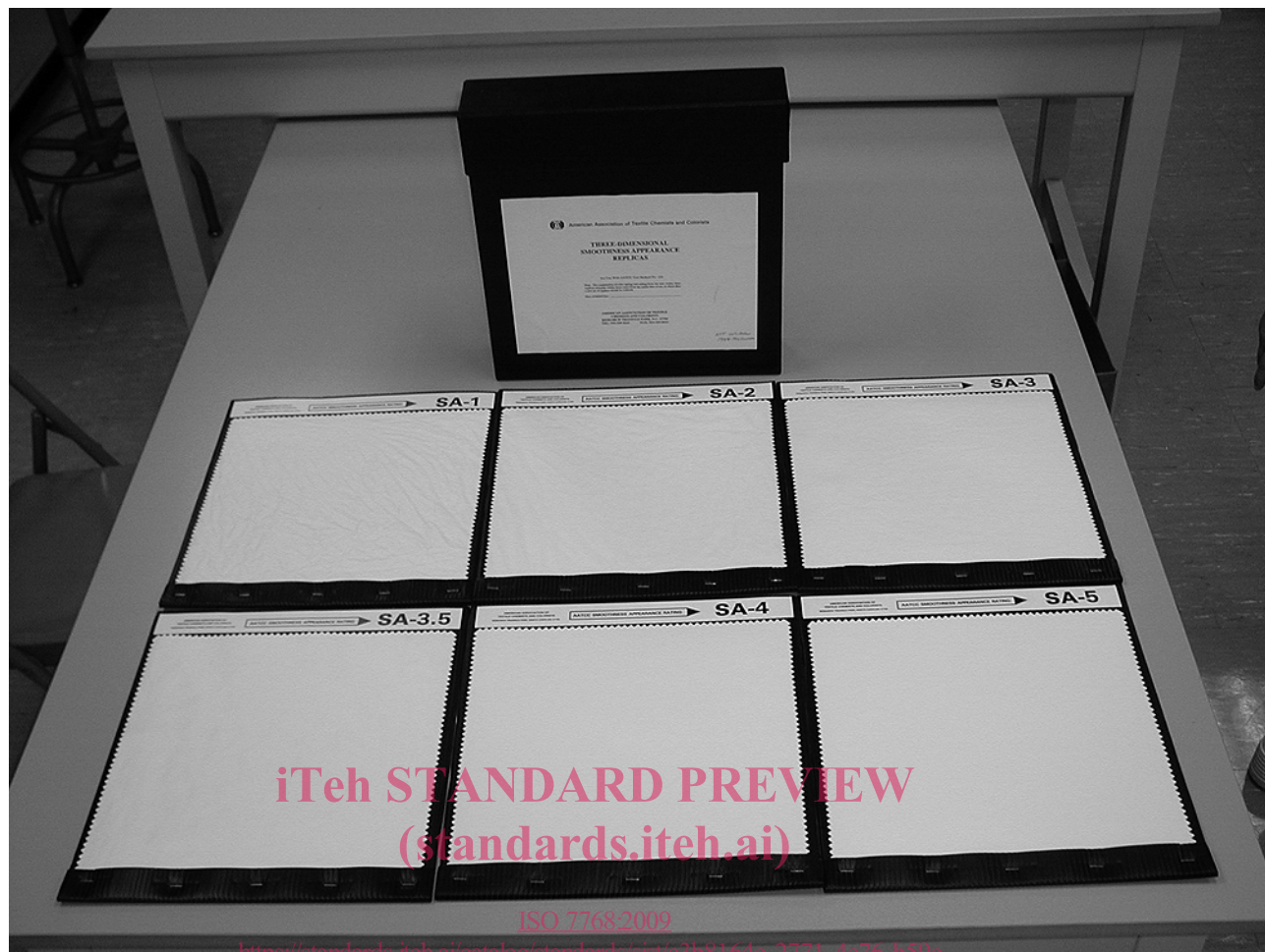
Figure 2 — Three-dimensional smoothness appearance replicas