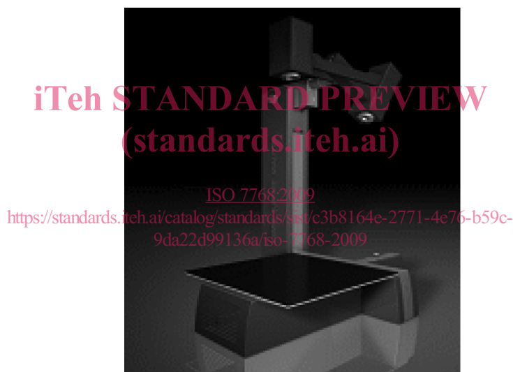
Figure B.1 — 3-Dimensional scanning system

B.2.1 A 3-dimensional scanning system was used to measure digital images of ISO smoothness replicas as shown in Figure B.1. Specifications for the scanning system are shown in Table B.1.