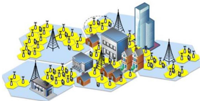
Figure 2(a): Deployment mode of the 5G base station