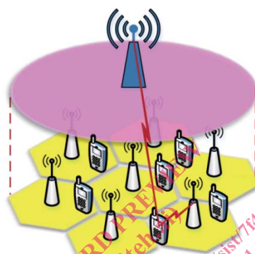
Figure 2(b): Micro base station