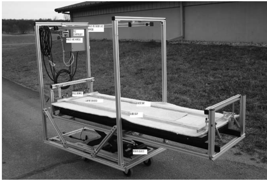
FIG. 2 Cleaning Bed Apparatus

5.11 Drive for carpet or vacuum cleaner capable of maintaining specified test speed of 55 cm/s (1.8 ft/s) both forward and reverse in a straight pattern. Bed must be equipped with brackets to hold the test vacuum handle at 80 cm (31.5 in.) above the test material.