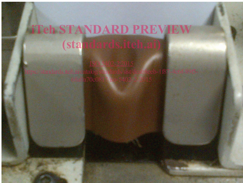
b) Side view — Crease pattern in example test piece