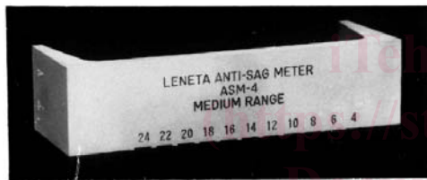
FIG. 2 Medium Range Anti-Sag Meter

vertically with the drawdown stripes horizontal, similar to rungs of a ladder, with the thinnest stripe at the top. After drying in this position, the drawdown is examined and rated for sagging. A typical sag pattern obtained by this procedure is shown in Fig. 3.