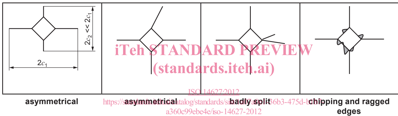
Figure 2 — Guidelines for the unacceptable indentations

Only indentations whose four primary cracks emanate straight and radially from each corner shall be accepted. Indentations with badly asymmetrical, split or forked cracks or with gross chipping shall be rejected. If the difference between the horizontal crack length and the vertical one is more than 10 % of the mean value of the horizontal and vertical ones, the result shall be rejected.