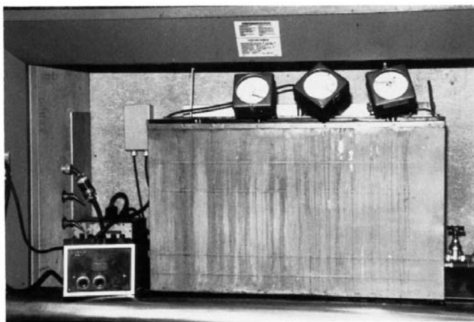
FIG. 1 Rotating Vessel Oxidation Test Apparatus