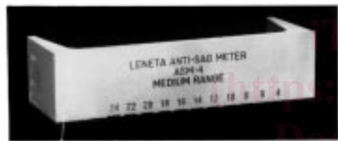
FIG. 2 Medium Range Anti-Sag Meter

This method provides simple and rapid tests, whereby sag resistance is demonstrated by a visible sag pattern, and is rated objectively in terms of numerical values that correlate with brushout test observations.