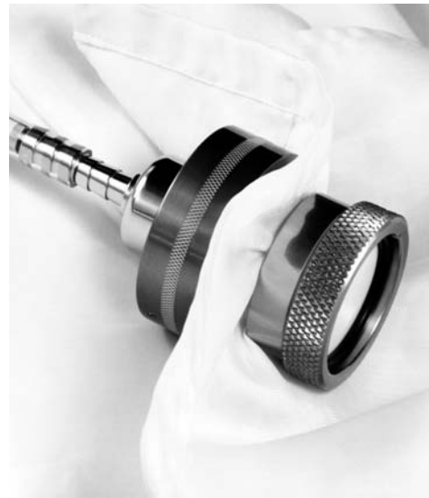
FIG. 2 Adapter

6.4.4 Plastic Petri Slides with Covers , 6 plastic petri dishes, 60-mm diameter or glass microscope slides, 50 by 75 mm.