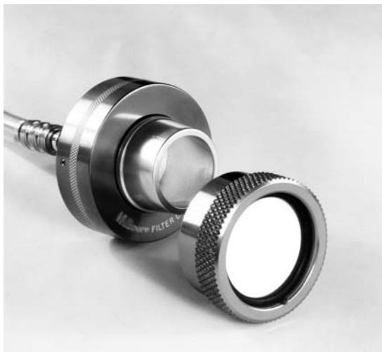
FIG. 1 Filter Assembly