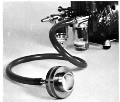
FIG. 3 Typical Air-Sampling Filtration Apparatus