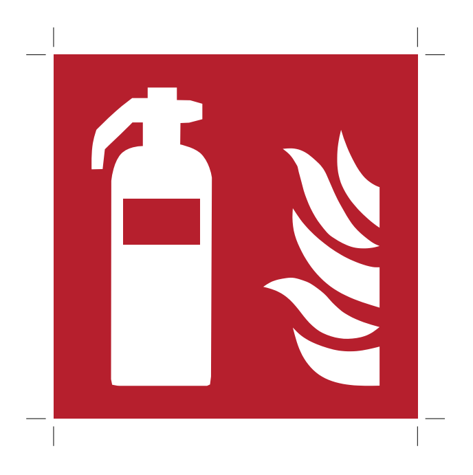
Figure 6 — Fire extinguisher (ISO 7010-F001)