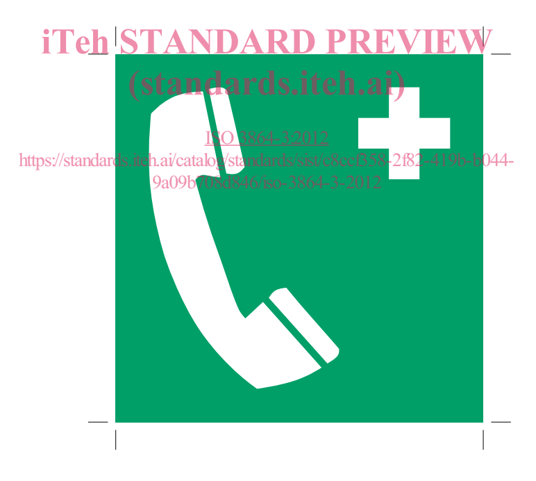
Figure 5 — Emergency telephone (ISO 7010-E004)