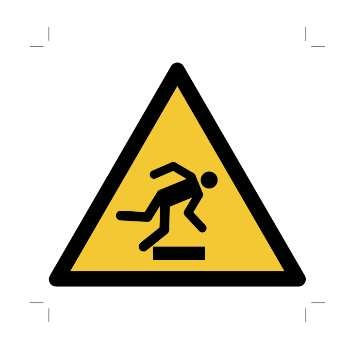
Figure 4 — Warning; Floor-level obstacle (ISO 7010-W007)