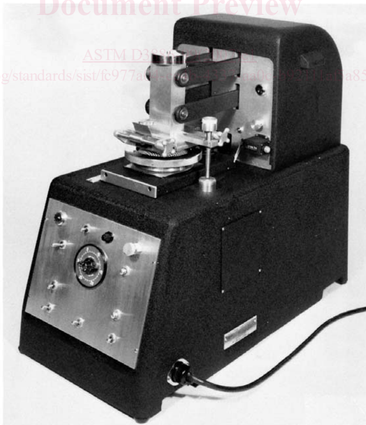
FIG. 2 One Type of Commercial Inflated Diaphragm Abrasion Tester