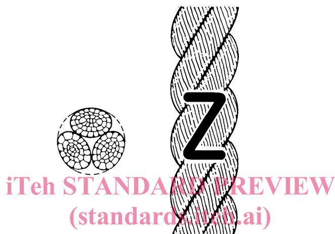
ISO 1140:2012 Figure 1 — Shape of a 3-strand hawser-laid rope (type A) https://standards.iteh.ai/catalog/standards/sis/7207c5a1-c732-45a0-b495-59301b91782a/iso-1140-2012