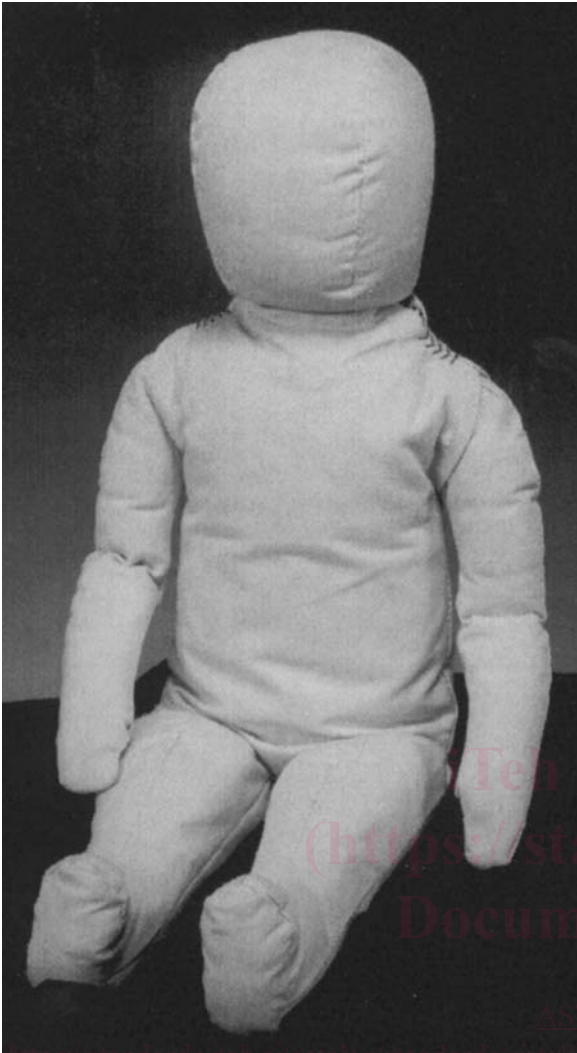
FIG. 1 CAMI Infant Dummy, Mark II 17.5 lb (7.9 kg)

16 CFR 1509 Requirements for Non-Full-Size Baby Cribs