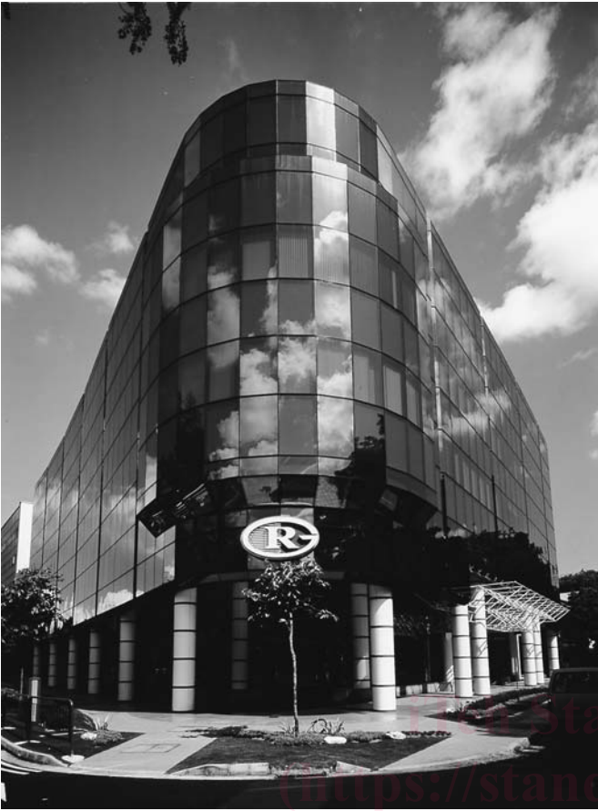
FIG. 3 Four-Side SSG System