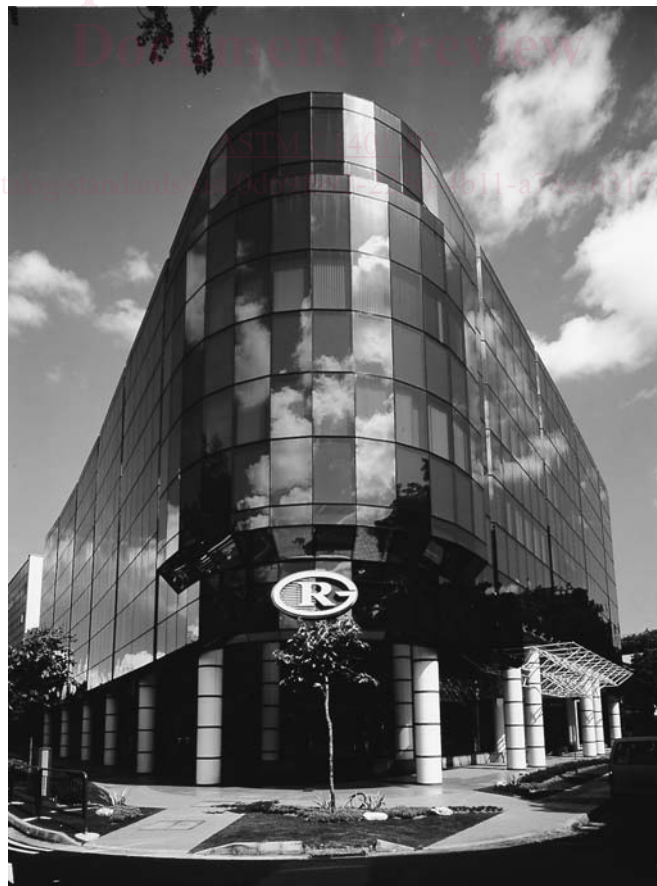
FIG. 3 Four-Side SSG System

16.5.1 Walls that are sloped more than 15° from vertical generally are treated as sloped glazing (Fig. 5) (1315, 1416, 1517). Sloped glazing can be either inward or outward sloped, sometimes called reverse slope. If inward sloped, a compressive load is applied to the structural sealant joint due to the weight of the glass or panel. If outward sloped, a dead load due to the weight of the glass or panel exists, which creates a downward and outward force on the structural sealant joint. Sloped SSG systems conceptually are the same as vertical two- and four-side SSG systems except for the degree and direction of slope from vertical,