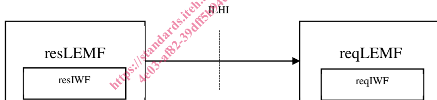
Figure 5.1: Architecture overview of Inter LEMF Handover Interface (ILHI)

Figure 5.1 shows the architecture overview of the ILHI.