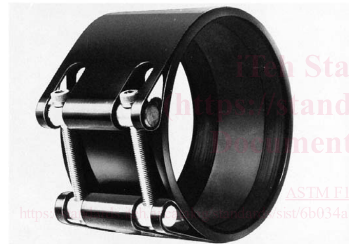
FIG. 3 Type II—Class 2 Typical Construction

6.1.1.2 Grooved mechanical coupling housings shall be coated with the manufacturer’s standard preparation and paint, or at the purchaser’s option, hot-dip galvanized in accordance