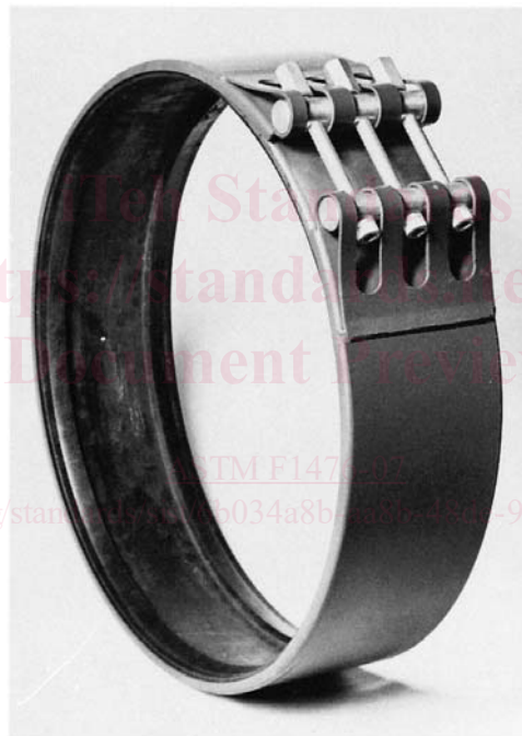
FIG. 4 Type II—Class 3 Typical Construction