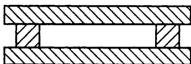
FIG. 1 Flash Picture-Frame Mold

5.2.1 Mold Types —Several different types of molds may be used for the compression molding of test specimens of thermoplastics. In general, however, the molds used will fall into one of two categories: a flash-type mold (see Figs. 1 and 2) or a positive-type mold (see Fig. 3). The characteristics of the test specimens prepared by using different types of molds are not the same. In particular, some mechanical properties may be affected by the pressure applied to the material during cooling.