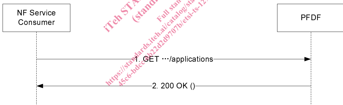
Figure 4.2.2.2-1: Retrieval of PFDs

This procedure as shown in Figure 4.2.2.2-1 is used to retrieve PFDs for an application identifier from the PFDF.