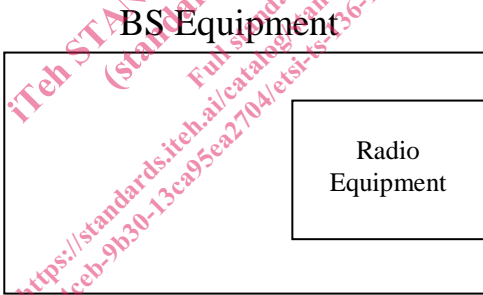
Figure 3.1.2: BS with single enclosure solution