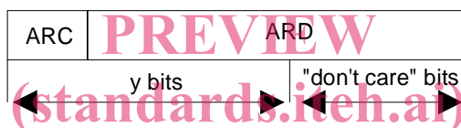
Figure 4.2: Structure of PARK\{y\}

The common base for the DECT identity structure is the Access Rights Class (ARC) and Access Rights Details (ARD). These need to be known by both the FP and the PPs. In the FP the ARC and ARD are called Access Rights Identity (ARI), and in the PP they are called Portable Access Rights Key (PARK). The distinction between PARK and ARI is that each PARK can have a group of ARDs allocated, PARK\{y\} . "y" is the value of the PARK length indicator given in the PP subscription process.