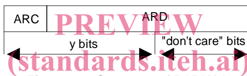
Figure 4.2: Structure of PARK\{y\}

The common base for the DECT identity structure is the Access Rights Class (ARC) and Access Rights Details (ARD). These need to be known by both the FP and the PPs. In the FP the ARC and ARD are called Access Rights Identity (ARI), and in the PP they are called Portable Access Rights Key (PARK). The distinction between PARK and ARI is that each PARK can have a group of ARDs allocated, PARK\{y\} . "y" is the value of the PARK length indicator given in the PP subscription process.