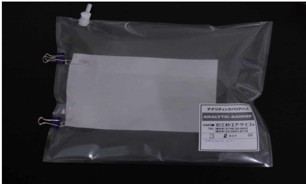
Figure 2 — Specimen in a plastic bag

7.4.3 Hold the specimen by clips from outside of bag to make easier operation. Then, seal the opened edge of the bag for insertion of specimen by using heat sealer (6.3).