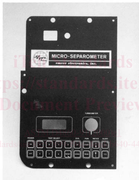
FIG. 1 Micro-Separometer Mark V Deluxe and Control Panel

water. The degree of water and particulate contamination can be measured using other methods such as Test Methods D 1744, D 2276, and D 2709.