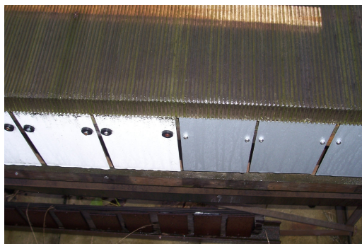
Figure 1 — Detail of grooves to be machined – Top view