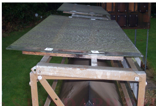
Figure 2 — Detail of grooves to be machined – Side view