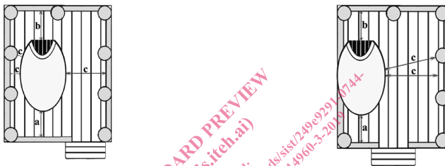
a) snappy structure not integral with outside wall of the base inflatable